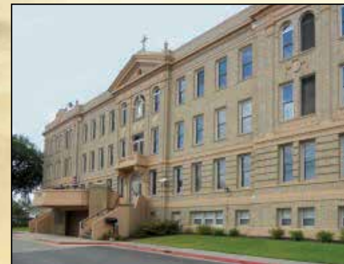
story follows top of next page ▶

By 1840, the Sisters had opened Mount Carmel School, an all girls school in the St. Augustine area of New Orleans. The Sisters expanded and moved their ministry in 1926 into the outlying areas of New Orleans, where they constructed a four story building on land reclaimed from Lake Pontchartrain. That building housed a school on the lower level and served as a motherhouse on the upper floors. Today's Mount Carmel Academy is an 8th through 12th grade Catholic school for single young ladies in the Archdiocese of New Orleans. Over the years, that one building has grown into many buildings, including a fine arts center, assembly hall and gymnasium, the original building still serves as a motherhouse with a pre-school located on the lower level.