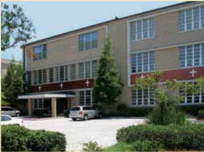
Mount Carmel Academy, New Orleans, Louisiana

While all of these sights are reminders of the storm that raged on that late August day, there are other sights too, ones that bring hope — new roads and bridges, homes being rebuilt, new building construction, businesses finally starting to return, and of course, Mount Carmel Academy and St. Stanislaus College, testaments to faith, service and the resilience of the human spirit. ☼