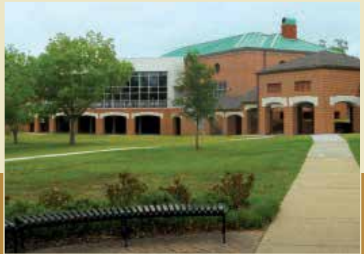
St. Stanislaus College, Bay St. Louis, Mississippi

“The residents of these communities continue to rebuild their lives five years later.”