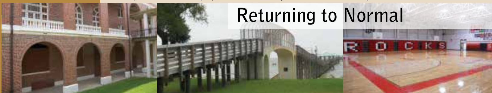
Images taken after rebuilding. Top: Mount Carmel Academy - Bottom: St. Stanislaus College