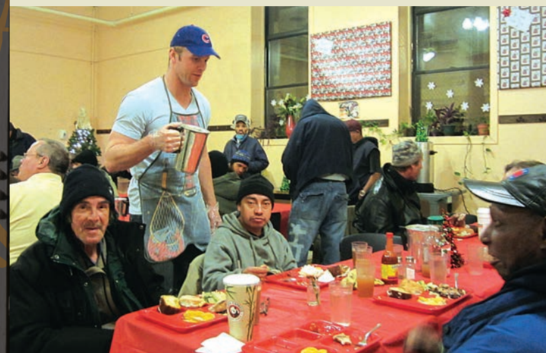
Volunteer serving guests at the Marquard Center soup kitchen.