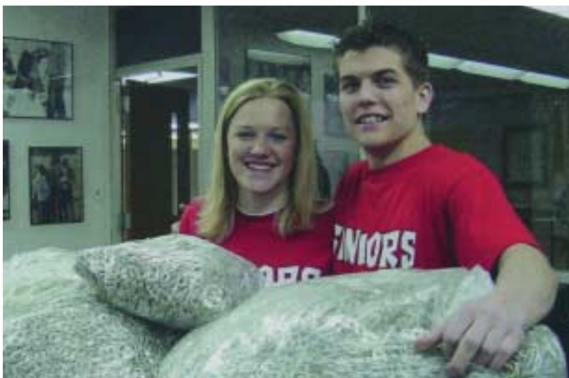
Montini Catholic H.S. students collected 75 pounds or 90,000 aluminum pop tabs for Ronald McDonald House in Chicago.

More than ever, Lasallian education that promotes a solid values-based education, respect for students, promotion of self-respect, values in one’s personal life and concern for the less fortunate, along with modern, practical and up-to-date education is needed today. These are the opportunities we Brothers and Lasallian partners have, and these are the challenges.