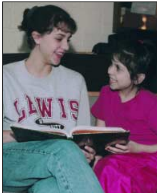
Lewis University Big Brothers/ Big Sisters Program