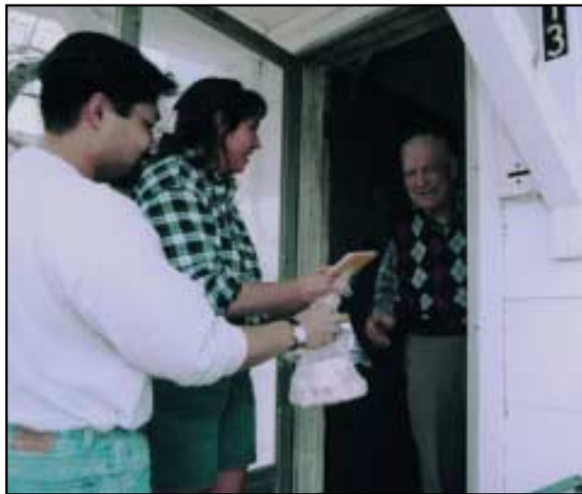
Lewis University Volunteers for Meals on Wheels