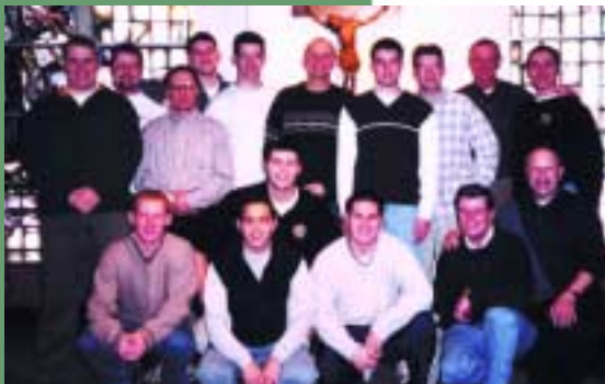
Wappingers Falls Regional Vocation Retreat

In January, a group of 70 young men and Brothers from across the United States gathered at Mount Alvernia Retreat House in Wappingers Fall, New York, for the annual Regional Vocation Retreat to pray, discuss and discern their vocation. Contacts, aspirants, and Brother candidates met with postulants, novices, temporary and perpetually professed Brothers to discern God's call in their lives.