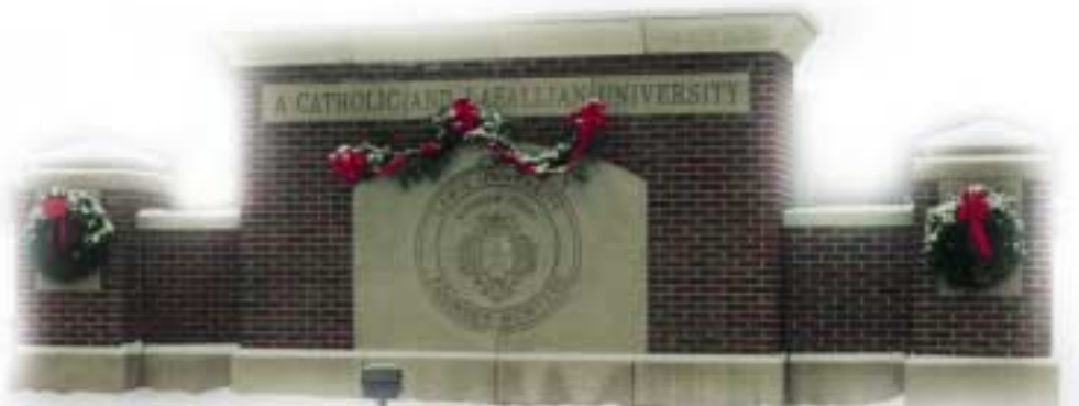
New Entrance at Lewis University