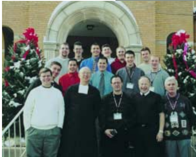
The Contacts and Brothers from the Midwest District pose for a final picture before departing Wappingers Falls.