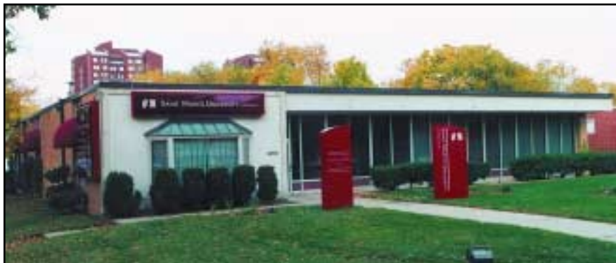
Saint Mary's University of Minnesota

The Lasallian charism expresses itself on the Saint Mary's University campus, in the context of three variables unique to higher education: the growth in maturity of the students; the role of the students in the Lasallian pursuit; and the particular relationship between teacher and learner.