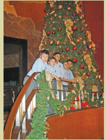
STUDENTS BESIDE THE RADIO CITY CHRISTMAS TREE.